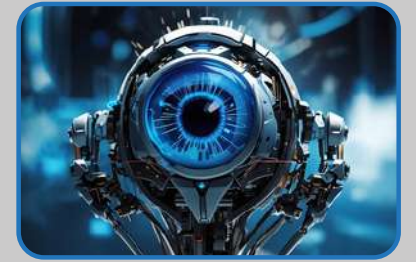
Eye to the Future