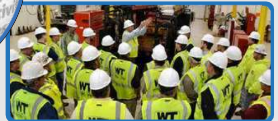
Quality & EHS