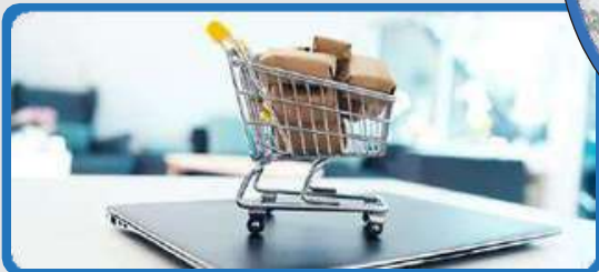
Sales & Retail