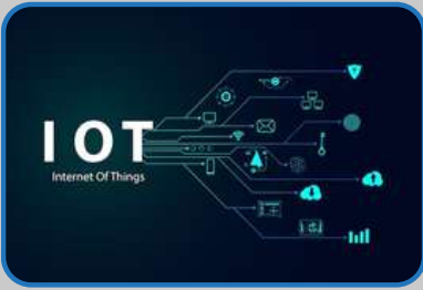
Internet of Things (IoT)